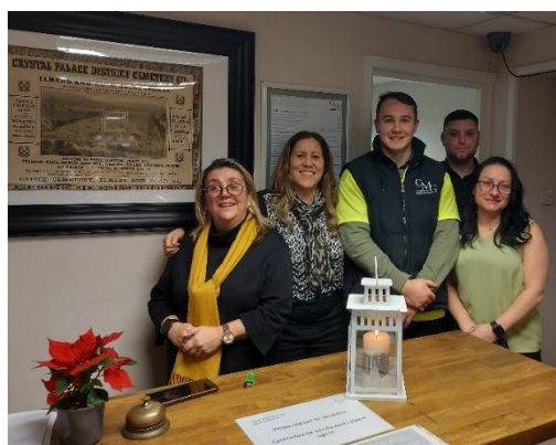
The Peace Light from Bethlehem