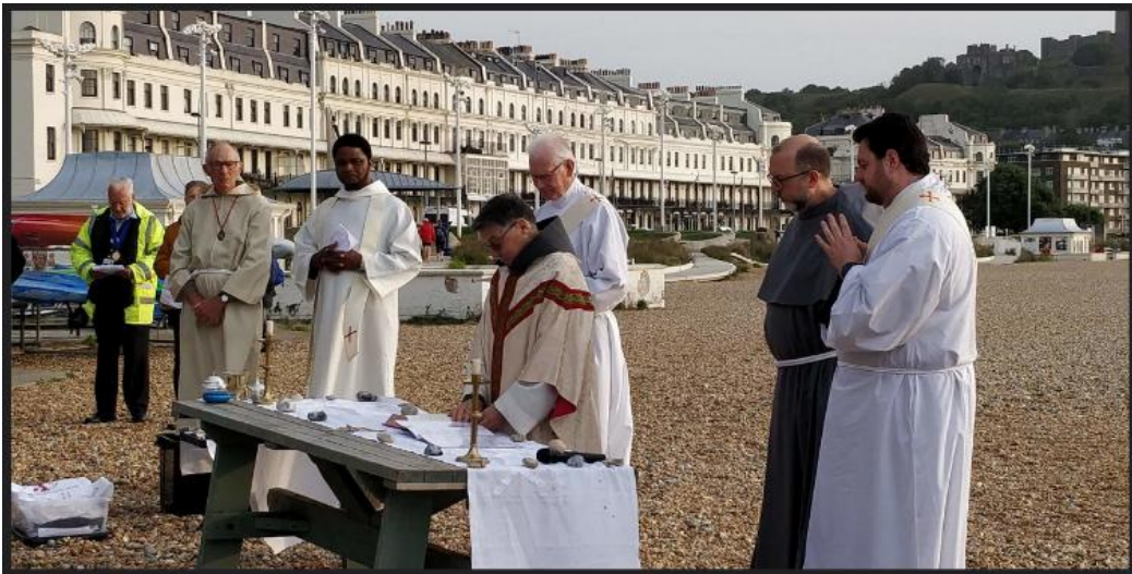
Franciscan Mass on the Beach at Dover