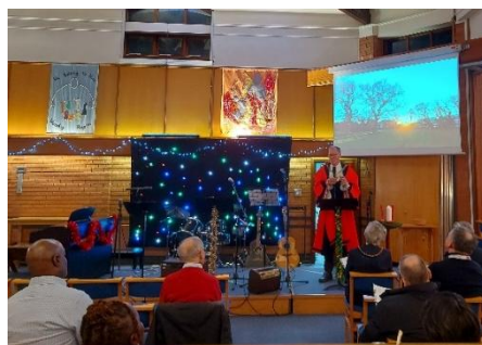
Betts Park service held inside