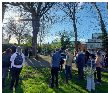
Way of the Cross