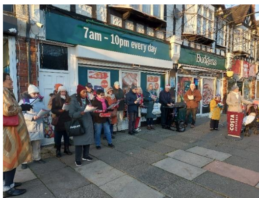
Community Carol singing