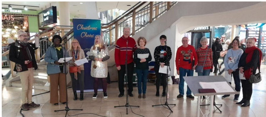
Some members of the Bluewater Chaplaincy team carol singing.

Thank you, as always, to Kent Workplace Mission for the opportunity you've given me to manifest my love of God and his calling to me to be available to staff at Bluewater as a Chaplain.