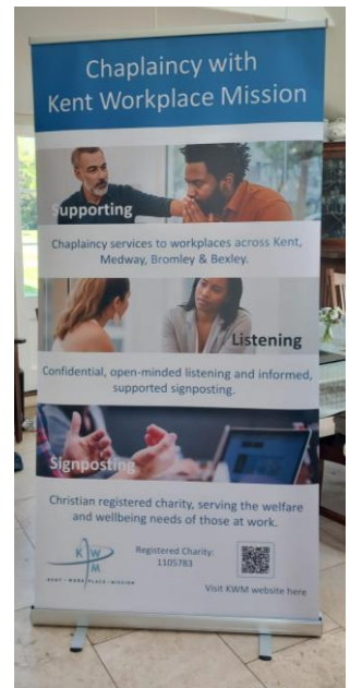
KWM Banner 200cm x 100cm

We have a website, packed with useful information and a point of contact to find out more | Kent Workplace Mission We also have a presence on social media as well as chaplains, trustees and supporters giving talks to churches and groups.